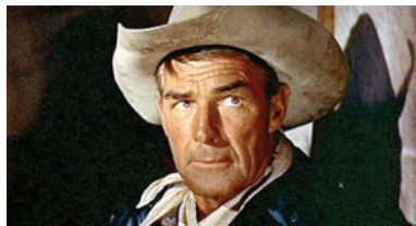
Randolph Scott in one of his numerous roles as a cowboy.

Soon after that debut, Scott was — according to Hollywood legend — hired to teach Gary Cooper how to speak like a Virginia native in "The Virginian," in 1929. But soon after, Scott moved up to speaking roles on the big screen. His first starring role was in 1931's "Women Men Marry." From there, Scott was well on his way to Hollywood success. From the mid 1930s to the mid '50s, he was one of the biggest film stars in the world.